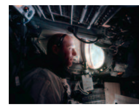
ASTRONAUT ABOARD GEMINI 9

Today we design, manufacture and sell 24 product lines of fine and ultra fine aluminum oxide, boron carbide, silicon carbide, and cerium oxide powders used in everything from toothpaste to cellular phones. As the number of applications for our product grows, so does our company. Production, warehouse and office space totaling over 140,000 square feet and supporting over 60 employees enables us to handle any size challenge.